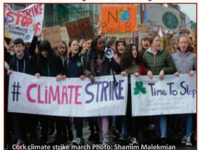
Cork climate strike march

It is true that many problems are far too big for us as individuals. In such cases, Governments must lead. Our role is to encourage them to do what is necessary and right to promote the common good. Recently we have seen this approach succeed, we have seen what individuals and communities can do. Young people all around the world have called for change and for attention to be paid to climate change. Greta Thunberg, a sixteen year old Swedish girl, has become a powerful voice calling on leaders to concentrate on what is important for the common good rather than national interests, economics or power. Leaders and Governments, including our own have begun to listen.