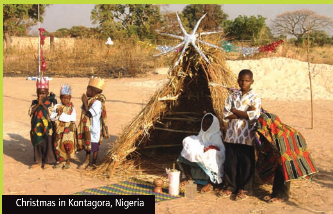
Christmas in Kontagora, Nigeria

Before the end of the Christmas period we had our usual Christmas party for the four seminarians from this parish. A few days later we had our party for the thirteen Postulants and two Sisters of the Nativity congregation. They live about 12 miles away. Arriving at 12 noon and left around 5.30pm. After our lunch I got out my Bingo set, and they enjoyed playing Bingo until all the prizes were finished! Sometimes if I'm in a crowd and I hear a shout, 'Bingo', I know it's one of the Nativity Postulants greeting me.