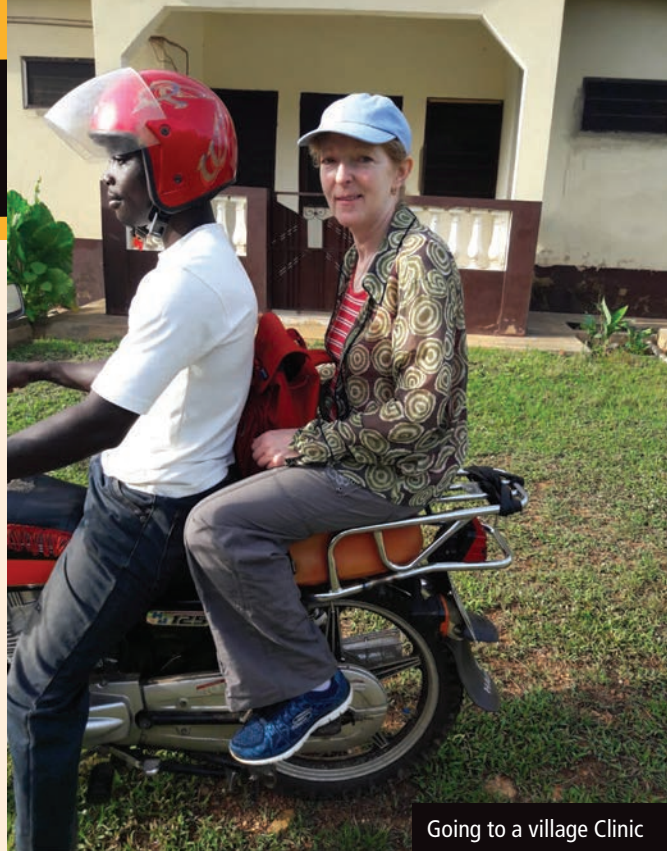
Going to a village Clinic

Young children were brought in by their parents, or in many cases, a grandparent, in very weak condition and would receive urgent treatment, but would not survive. Often, depending on their religion or customs, the body of the child was wrapped up, placed on the parent or